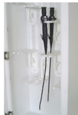
M1295 Holder can hold two small scopes with no light-source leads.