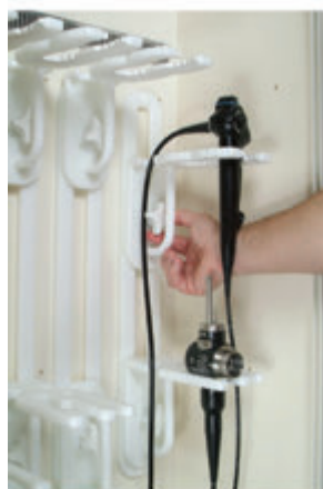
M1295 Holder storing a small scope with a light-source lead.